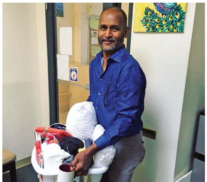
New resident moves into Lafayette Street in Salem with his welcome basket.