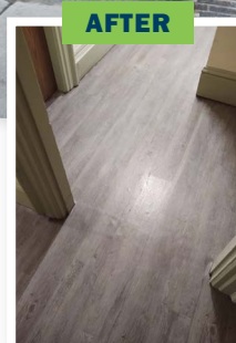
A new, safe, entrance at 1202 and beautiful new floors inside.