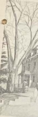
22 Fessenden Caritas Commu

Caritas Communities, Inc. Eighth Annual Dinner Dance September 22, 1993