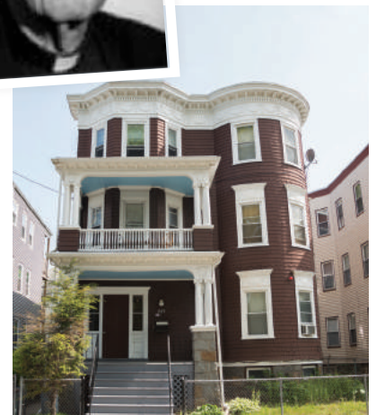
289 Centre Street, Dorchester